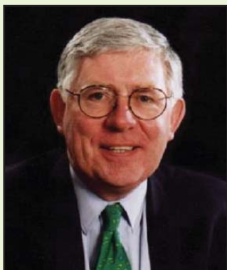
Lord O'Neill of Clackmannan

Following two very cold winters and recent high increases in energy bills, the issue of fuel poverty and the very real predicament of those unable to keep warm at an affordable price have been brought home to many of us.